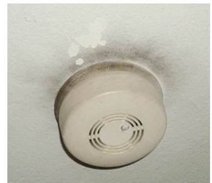
Figure 3. Ghosting of smoke detector