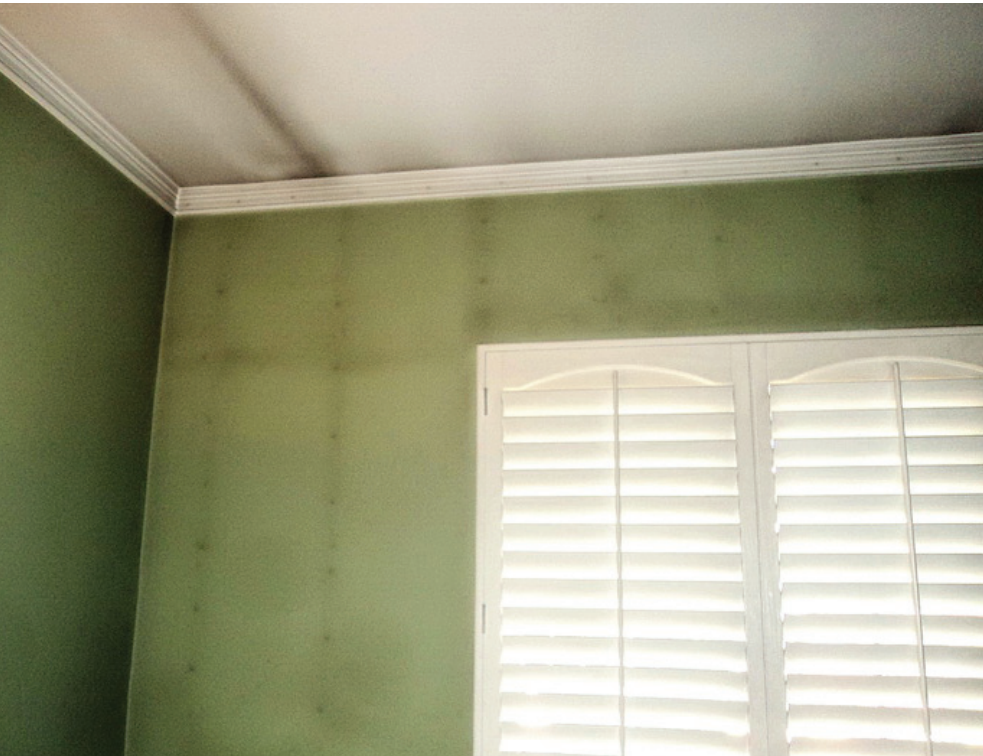
Figure 4. Nail pop

warmer smoke-laden air approaches the perimeter and slows, graduated shading reflects the release of particles. A similar mechanism may appear as vertical stripes on exterior walls when studs provide a thermal bridge between the exterior sheathing and interior drywall. Junction boxes displace insulation when installed within exterior walls, resulting in a colder surface around wall outlets and a typical deposit pattern of combustion particles.