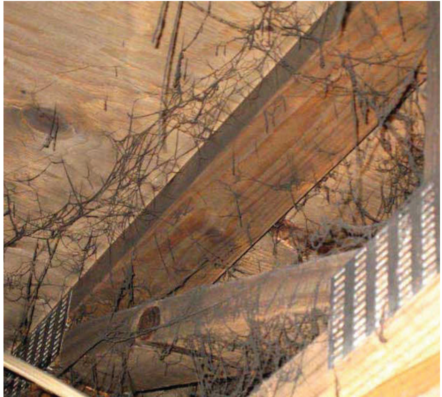
Figure 1. Smoke webs and chains

The physics of combustion, air currents and particle transport often produce characteristic deposit patterns. While many patterns are shared by dust and combustion particles, after a fire or furnace mal-