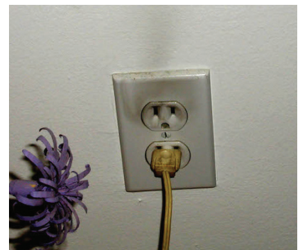
Figure 2. Ghosting of electrical outlet

Ghosting (Figures 2 and 3) This is a term applied to the shadowy outlining of electrical outlets and wall-hung graphics that often appears after fires. The air behind a wall-mounted artwork is still. As