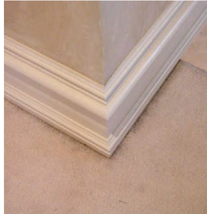
Figure 6. Filtration marks on carpet

Exterior Walls In traditional frame construction, exterior walls consist of uniformly spaced studs separated by fire stops and horizontal framing. Studs may be solid