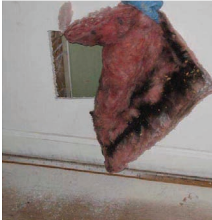
Figure 5. Filtration marks on insulation

commercial buildings, the ceiling is directly affixed to solid joists or rafters, creating discrete channels blocked at the ends. Horizontal chases and lighting fixtures may interrupt the exposed ceiling as well as the enclosed air space.